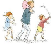
We're Going on a Bear Hunt Michael Rosen Helen Oxenbury

Vocab related to new topics learned in different contexts – Chinese New Year, Shrove Tuesday, Incarnation